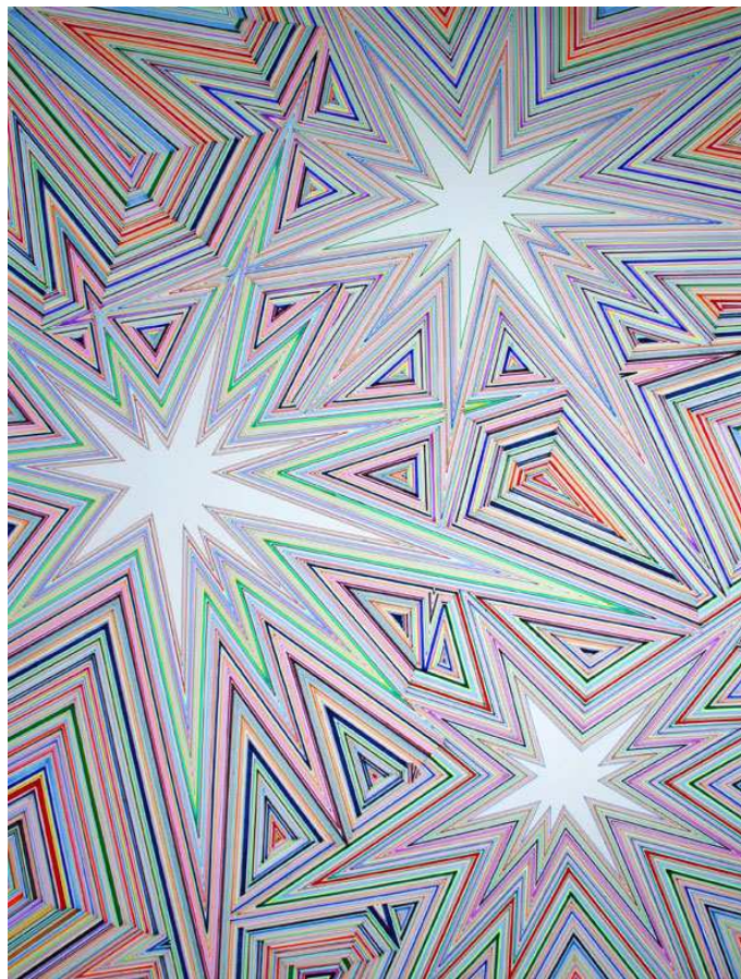
Kevin OSMOND - CROSSETTE # 1, 2009, Colored pen on paper, 46.1 x 35.47 inches (117.1 x 90.1 cm)

For additional information or images please contact Tara Marino at info@davidsongallery.com or 212-759-7555.